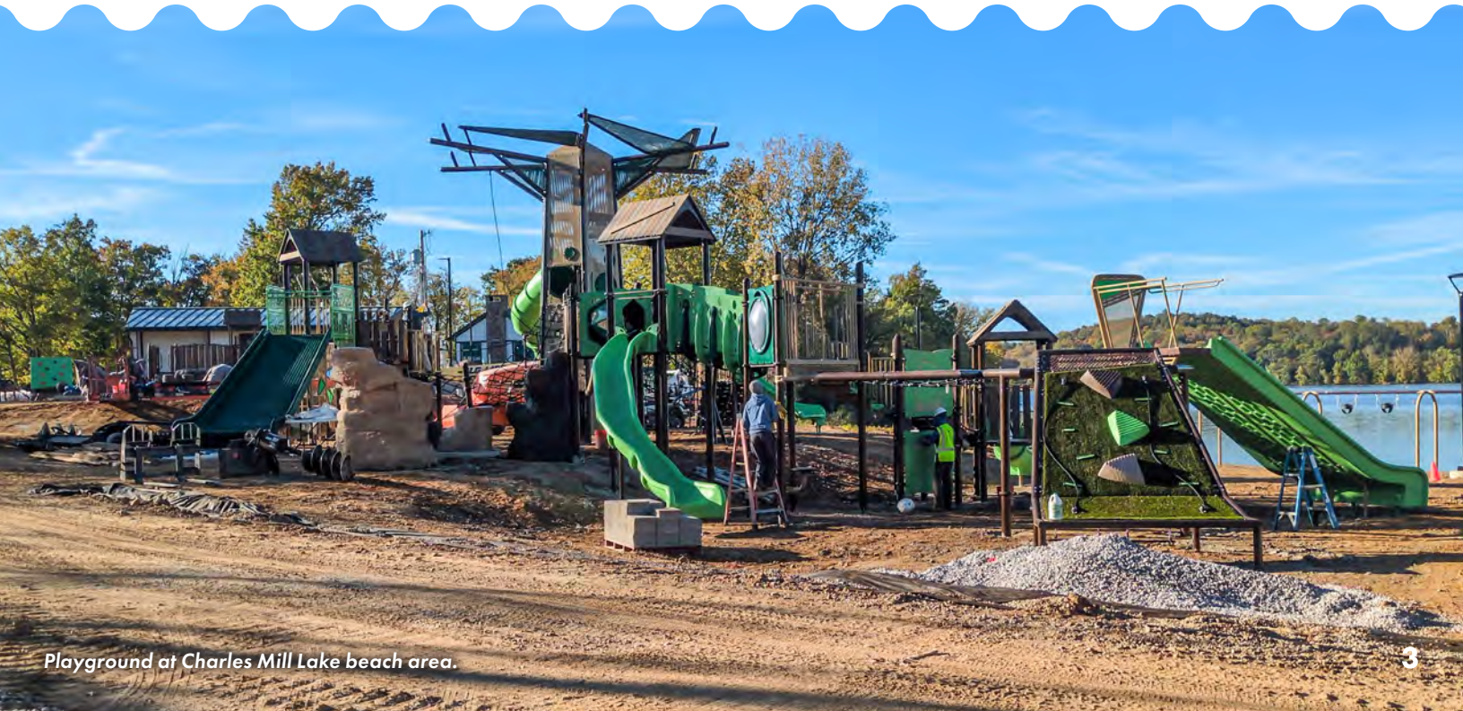
Playground at Charles Mill Lake beach area.

A new asphalt trail will provide improved pedestrian access between the Welcome and Activity Centers, the beach, and Area 5 Campground, with completion expected this summer. Construction is also underway on the Tappan Lake Regional Safety Center, a 12,530-square-foot multi-use facility that will serve as a ranger training center and home to the Tappan Lake Volunteer Fire Department. The facility will include garage bays, a shooting range, classroom space, a helicopter landing zone, and a storm shelter, with completion anticipated this fall.