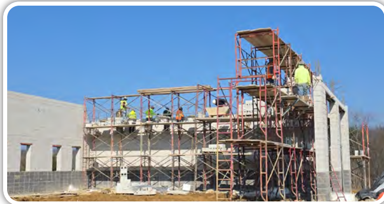
Tappan Lake Regional Safety Center scheduled for completion this fall.