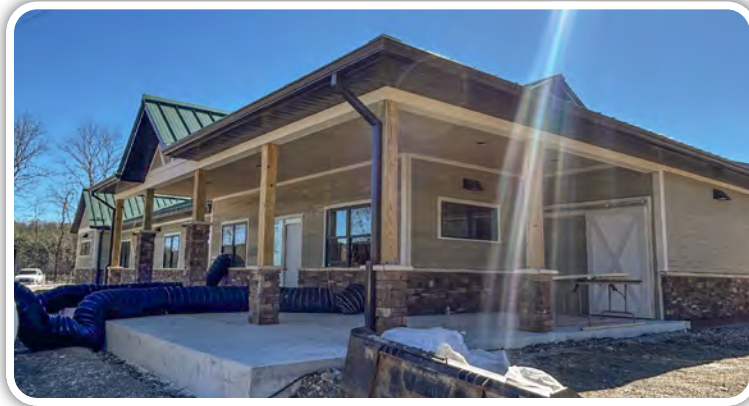
The new 3,400-square-foot marina building at Clendening Lake Marina is set to open by summer.