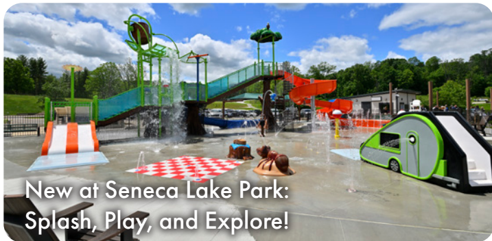
New at Seneca Lake Park: Splash, Play, and Explore!

With ribbon cuttings recently held at both Tappan Lake Park and Seneca Lake Park, we are celebrating some of our most exciting park enhancements to date, each one designed to bring people together through nature, play, and shared experiences.