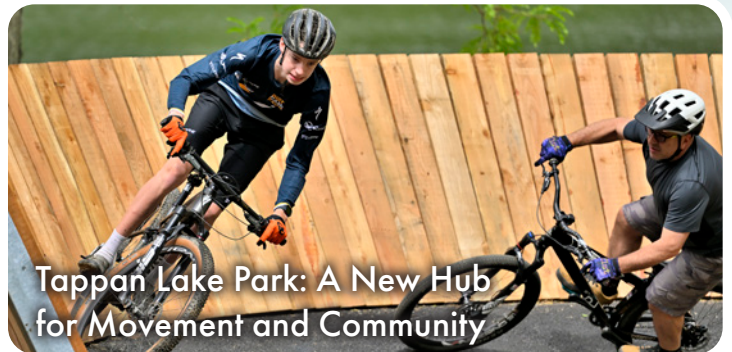
Tappan Lake Park: A New Hub for Movement and Community