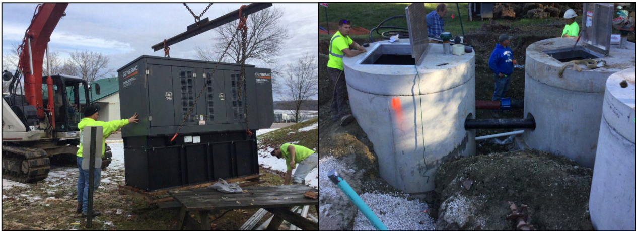
Sanitary sewer improvements at Seneca.

This report analyzed a vast amount of data, some of which was from the Bureau of Economic Analysis and some directly from MWCD. The analysis, which was based upon data about the multitude of interactions that exist between industries within the study region's economic system together with longstanding, widely accepted and applied analytical techniques, provided a significant amount of precise detail about the huge contribution made by MWCD to the study region's economy over the study period. The key finding is that once the multipliers are factored in, the total direct, indirect and induced impacts of the $310,919,843 in combined improvement, operations and maintenance expenditures made to industries, governments and households by the MWCD over this nine-year time period have altogether been in excess of $938,000,000. Thus, there can be no doubt that MWCD has made a significant economic contribution to the regional economy, and that this study has significantly increased the base of available knowledge about this contribution.