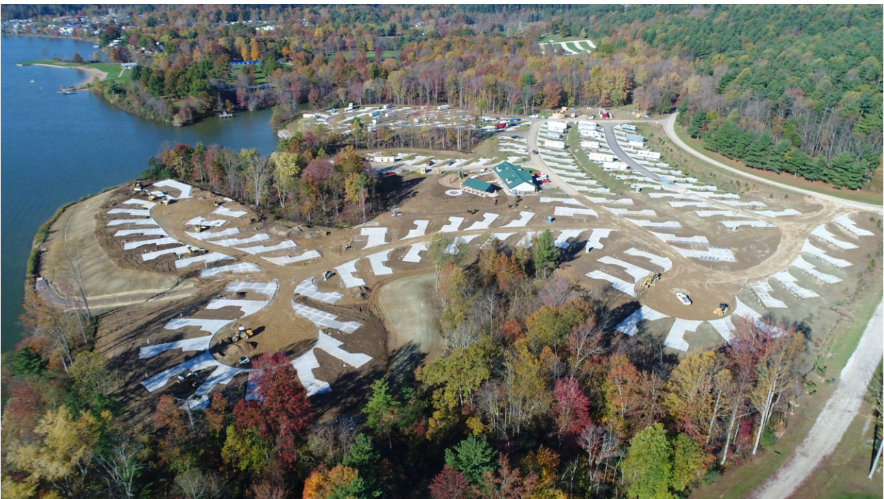
New full-hookup RV campground at Atwood.

Of the MWCD direct improvement expenditures for commodities over the study period, 86% went to three sectors: manufacturing products ($87,820,647), professional and business services ($33,073,287), and payments to households ($35,566,044). In turn, once these MWCD expenditures were turned over and over in the regional economy, as per the multiplier effects, the total impact on these three sectors alone was $123,793,123 and 330 additional jobs in manufactured products, $39,021,371 and 295 additional jobs in professional and business services, and $135,515,695 and 524 additional jobs through payments to households, respectively.