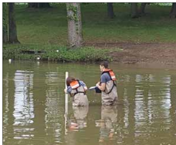
MWCD staff conduct water quality testing throughout the summer at the MWCD public beaches.

This past year MWCD hired an environmental scientist to serve as the Water Quality Coordinator to augment the monitoring program and enhance public education opportunities. Partner agencies have seized upon the skill set of MWCD staff. New water quality initiatives have already been organized and met with great enthusiasm.