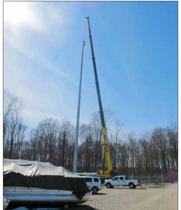
The newly installed MARCS tower provides critical safety communications and was constructed on MWCD property. The tower serves not only MWCD.