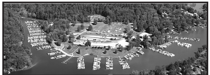
Atwood Lake Boats Marina West (above) is located next to Atwood Lake Park. Atwood Lake Boats Marina East is located just outside the Village of Dellroy.

The Marina West building, originally constructed in the 1940s,