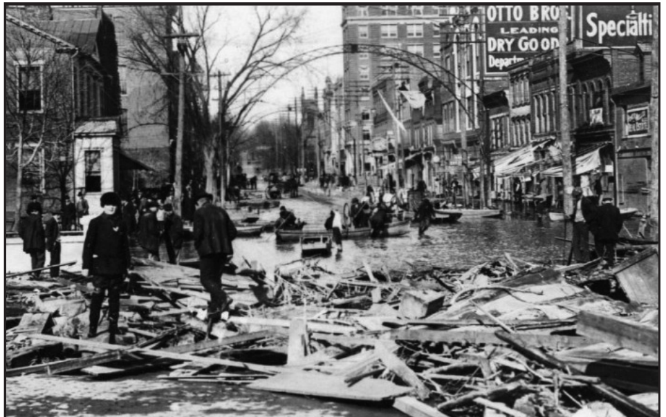
The Great Flood of 1913 wreaked devastation in many downtown areas in the Muskingum River Watershed, including Marietta.

Throughout much of the Midwest of the United States, where the storm was concentrated, ceremonies and other events have been held and are scheduled this year to commemorate the 100 th anniversary of the flood