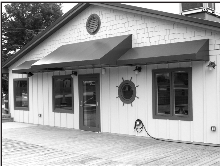
Renovations at Seneca Marina have transformed the facility that serves the boating public.