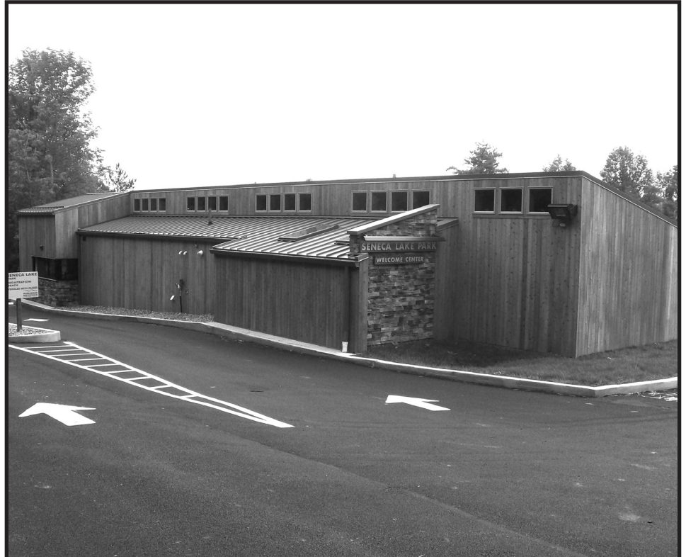
Seneca Lake Park's new Welcome Center includes offices for park staff members as well as serving as an information center for campers and visitors to the park and lake.

One of the top attractions at Seneca Marina this summer is The Dockside Restaurant at Seneca Lake Marina, which is open daily.