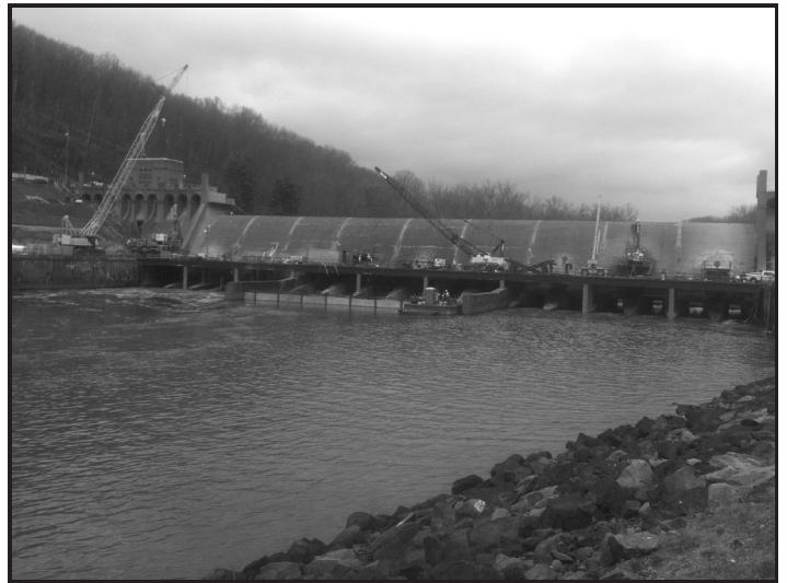
Projects to stabilize and repair eroded shorelines at the MWCD reservoirs (top), along with the safety assurance work at Dover Dam, are funded by the maintenance assessment.

neers (USACE). Projects are under way at both Dover and Bolivar dams in northern Tuscarawas County, the entire project plan at the dams is projected to cost more than $600 million and the MWCD share is estimated to be up to $137 million.