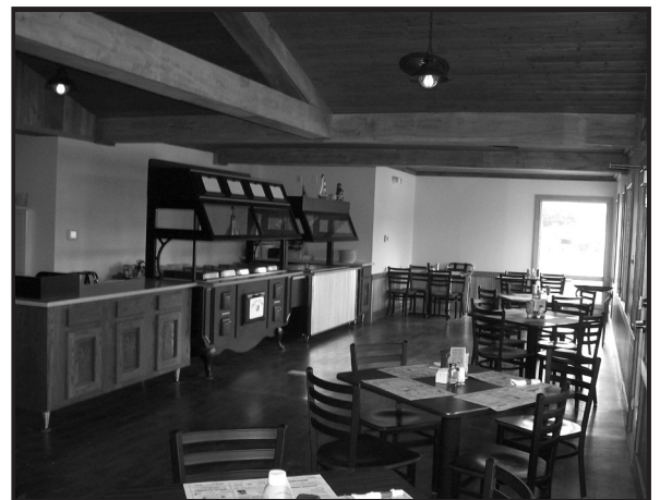
The Dockside Restaurant at Seneca Lake Marina is now open for business.