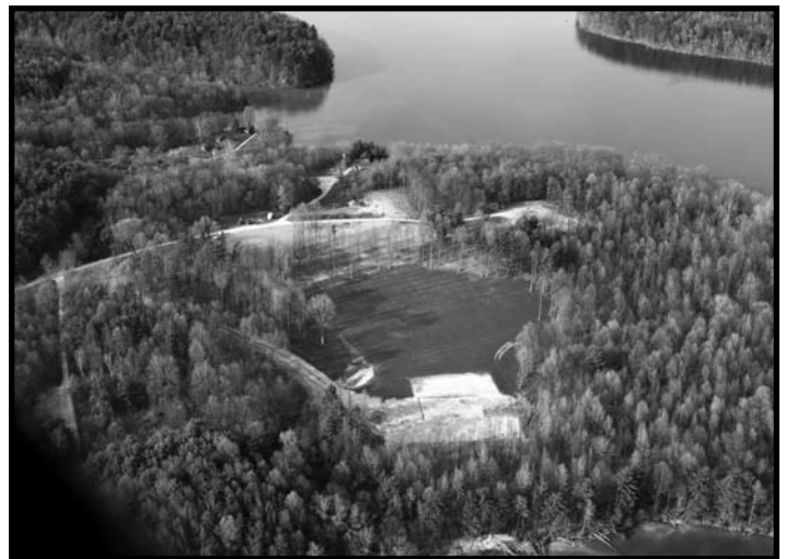
The staging area for the Alive Festival is located inside Atwood Lake Park.

“The economic benefits to the region from a tourism perspective