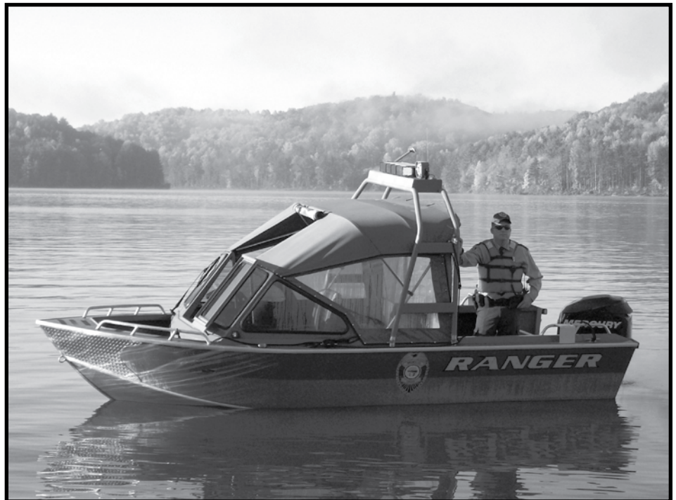
Many of the respondents to the customer satisfaction surveys from the MWCD indicated that they supported the security services offered by the MWCD on land and water.

In 2009, the MWCD Board of Directors adopted a goal stating: "To address our recreation operations in light of current economic conditions and customer