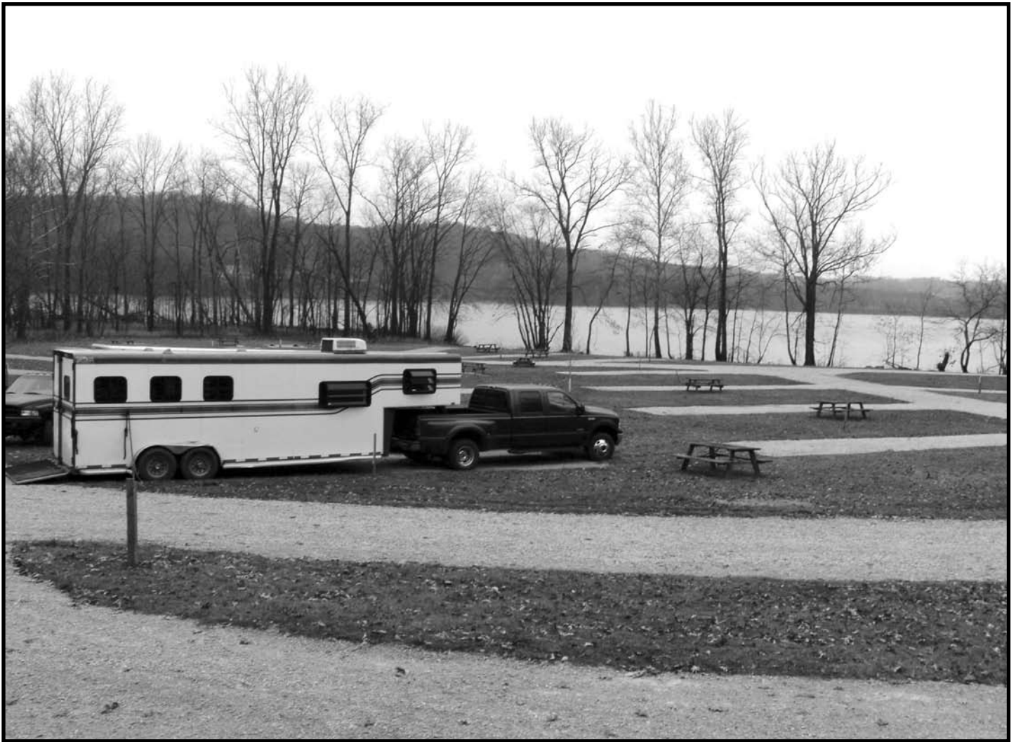
The horse camp area inside Pleasant Hill Lake Park offers spacious pads designed to accommodate trucks and trailers.