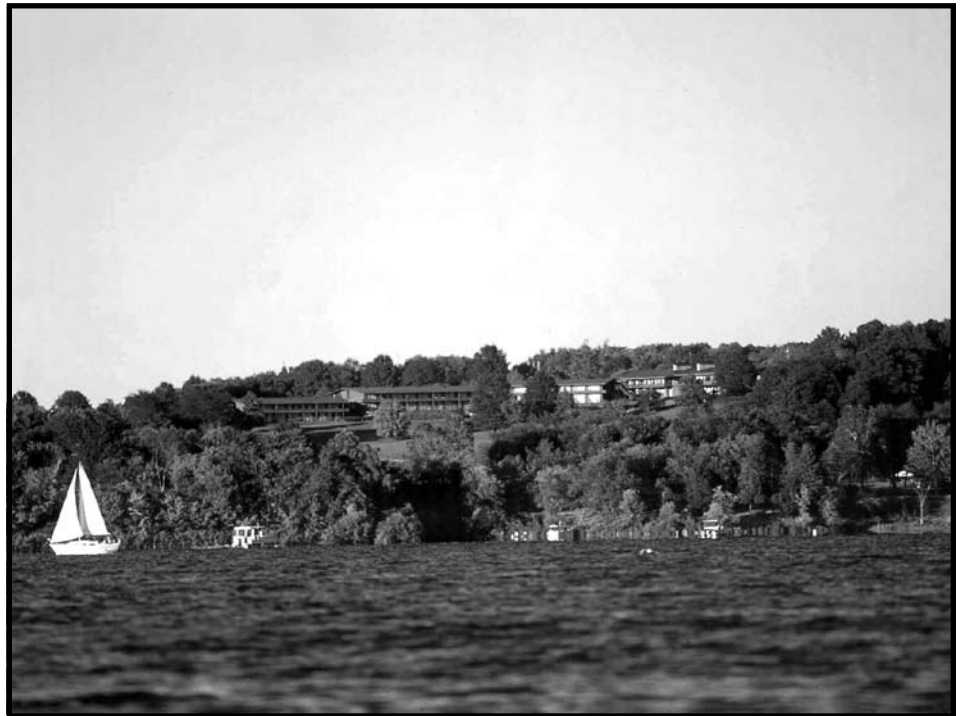
Atwood Lake Lodge has been a fixture in the lake community of Carroll and Tuscarawas counties since it opened in 1965.

The MWCD said that room occupancy for 2009 was slightly more than 30 percent,