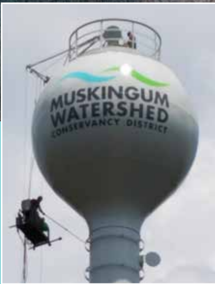
The Charles Mill water tower is complete as the Charles Mill main campground redevelopment is underway. (shown above)