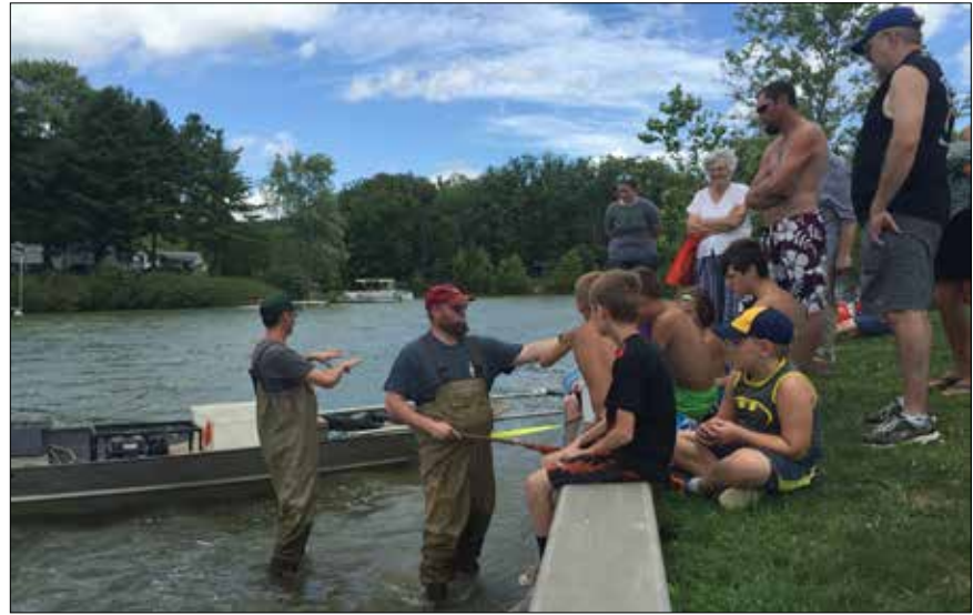
PWM grant funding has supported various watershed educational programs since 2009. Shown here, Ohio Department of Natural Resources, Division of Wildlife personnel provide hands-on experiences as part of the watershed education program at the Lake and Land Festival held at Atwood Lake in 2017.

The Board of Directors of the Muskingum Watershed Conservancy District (MWCD) approved a total of $464,328 in grants to six organizations located in five different counties in 2018. The Partners in Watershed Management (PWM) grant program provides assistance to local communities, agencies, and non-profit organizations in implementing water quality, conservation, flood reduction, and watershed education projects. The grant program is funded with revenue collected through the MWCD maintenance assessment. Since its inception in 2009, this highly successful program has provided over $7.1 million in grants for 106 projects. Funded projects are located in each of the 18-counties in the MWCD jurisdictional boundary.