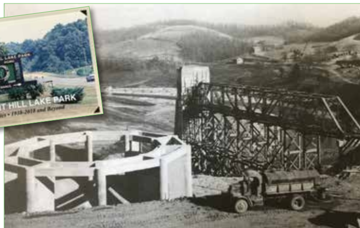
Historical photos and memories are included in the booklet Pleasant Hill Lake Park, Making Memories 1938-2018.

Learn more fun facts through Pleasant Hill Lake Park Making Memories 1938-2018 and Beyond available for $10 at Pleasant Hill Lake Park and local libraries in the Ashland and Richland areas. Also, check out the local history tab on the Pleasant Hill Lake website at https://pleasanthillpark.mwcd.org/park-info/park-history-1938-2018 .