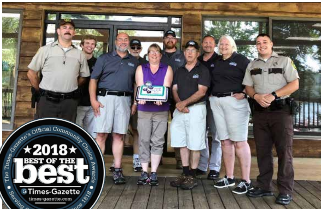
The Pleasant Hill Lake Park Staff members celebrate their Best Campground Award given through the Ashland Times-Gazette Community Choice Awards.

Congratulations to Pleasant Hill Lake Park who received the #1 Best Campground award through the Ashland Times-Gazette Community Choice Awards. Thank you to all who voted and much thanks and appreciation to Pleasant Hill Lake Park staff members.