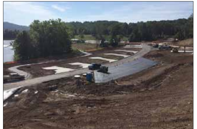
Contractors will install trees and shrubbery screening in and around the new camper pads now that the infrastructure is installed at the new Seneca Lake Parkside campground.