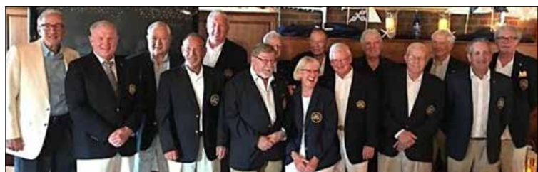
Atwood Yacht Club's present and former Commodores celebrate the club's 70 th anniversary.

Learn more fun facts through Pleasant Hill Lake Park Making Memories 1938-2018 and Beyond available for $10 at Pleasant Hill Lake Park and local libraries in the Ashland and Richland areas. Also, check out the local history tab on the Pleasant Hill Lake website at https://pleasanthillpark.mwcd.org/park-info/park-history-1938-2018 .