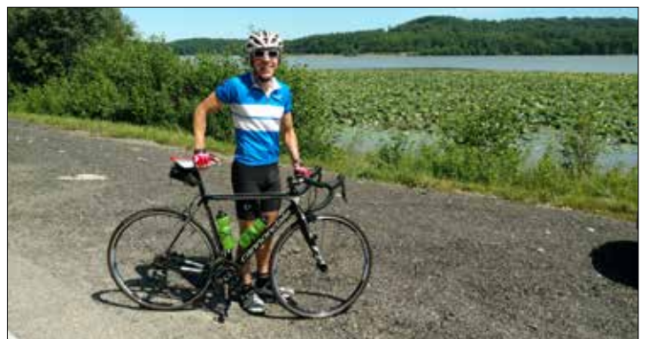
This year's 214-mile Tour de MWCD traversed through nine counties with stops at the six MWCD lakes located east of I-77.