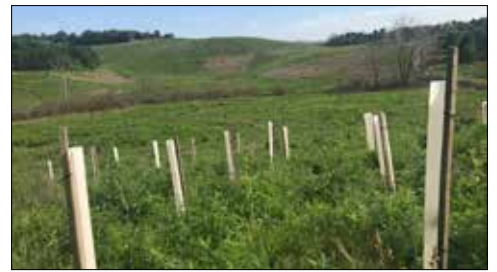
The 88,000 newly planted indigenous trees will provide potential bat habitat and many other expected environmental benefits in the ecosystem over the 130-acre site at Wills Creek Reservoir.

The work does not stop with the planting as MWCD foresters will continue to monitor the site to control invasive species as the young trees mature and eventually provide summer roosting opportunities for these threatened and endangered bat species.