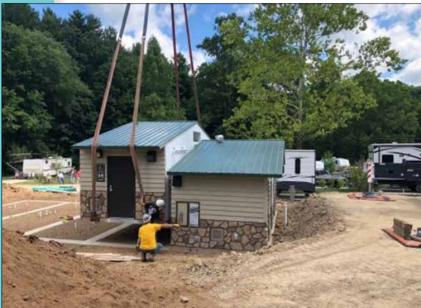
Contractors maneuver the pre-fabricated CXT restroom onto its foundation at Piedmont Lake campground.