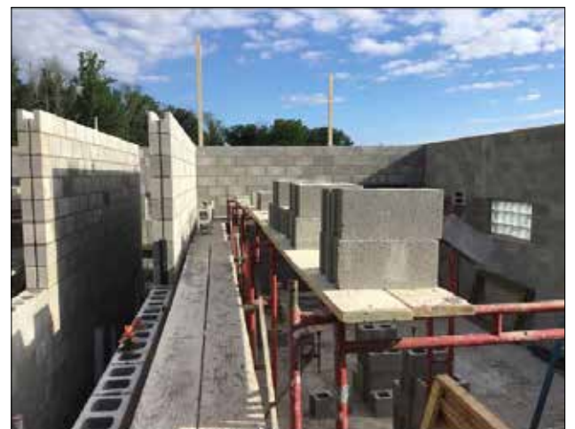
Progress is made on the new shower house at Parkside Seneca Lake campground.