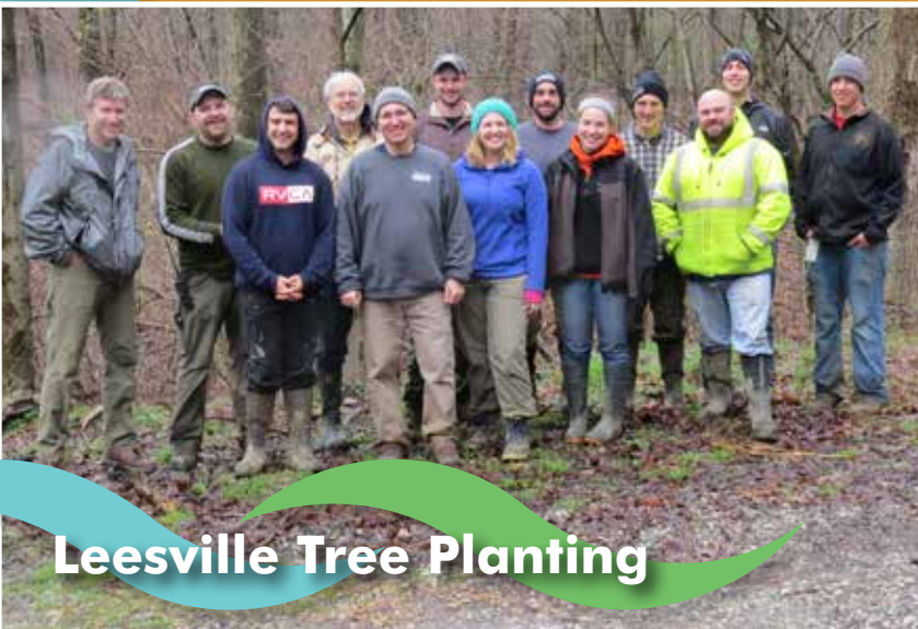
Leesville Tree Planting