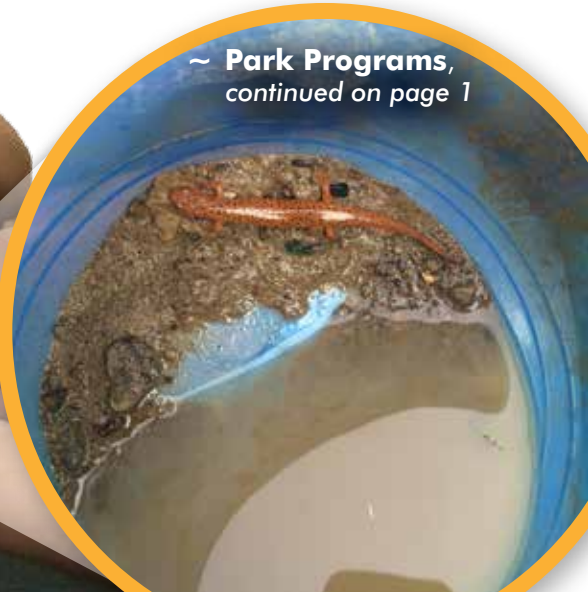
~ Park Programs, continued on page 1