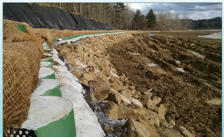
Shown are two examples of shoreline stabilization construction projects on MWCD reservoirs from early 2016 drawdown operations.