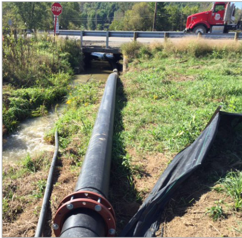
Temporary piping under US 250 takes the dredge material to the settling ponds and returns the filtered water to the creek. This pumping system greatly reduces truck traffic on local and state roads.

There, travelers along this corridor will see steel framing lined with filter fabric known as geo pools, sediment ponds and conveyor systems that in sequence will remove the water and dry the sediment. Water removed from the dredge material is returned to the creek that flows into Tappan Lake. Dredge material will also be deposited at the site using traditional excavation and trucking methods during the fall-spring drawdown. It is expected the dried dredge material will be acceptable for construction fill, landfill caps, farming and other useful applications.