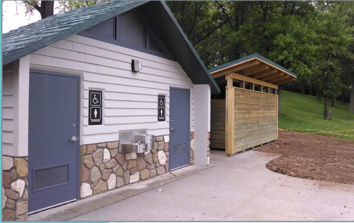
The new restroom at Pleasant Hill is indicative of the materials and colors that will be used throughout the new park facilities at all MWCD parks. Similar restroom models were installed at Piedmont, Clendening and Seneca.