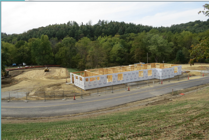
Construction continues on the Atwood Welcome Center which will be completed for the 2016 camping season.

Design teams are in place and dozens of projects, large and small, have been completed. Over $18 million in improvements throughout the MWCD's five major Parks and two of the District's Marinas have been realized to date. Park users should already see improvements taking shape, including the completed (or nearly completed) projects listed below.