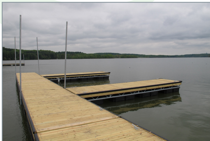
Typical Dock Improvements