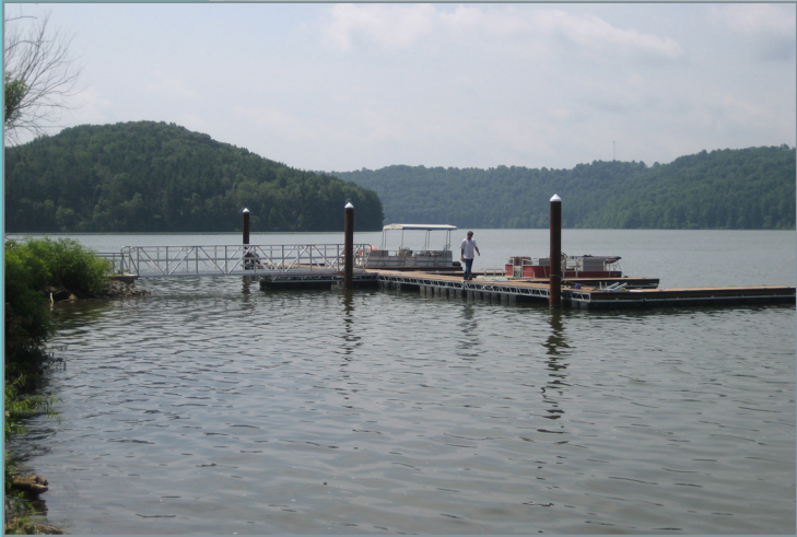
Dock replacements have been completed at Atwood, Piedmont, Pleasant Hill, Seneca and Tappan with more dock replacements to come throughout the District.