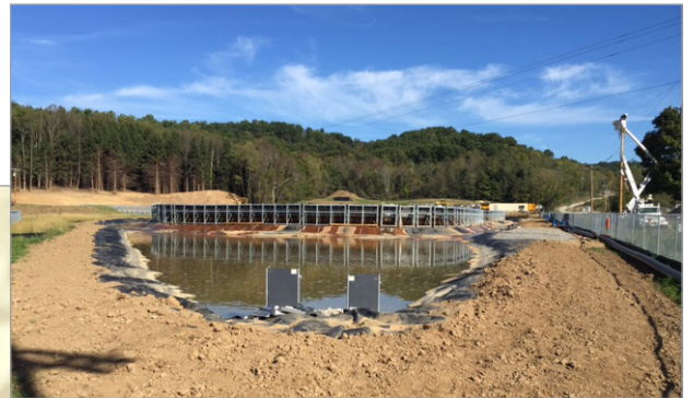
Above: One of the geo pools with steel framing and filter fabric located at Addy road on US 250.