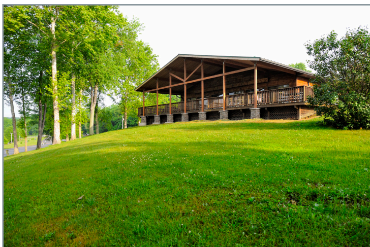
The completion of the new covered deck at Pleasant Hill created additional space for planned activities and a scenic view of the lake for MWCD customers.