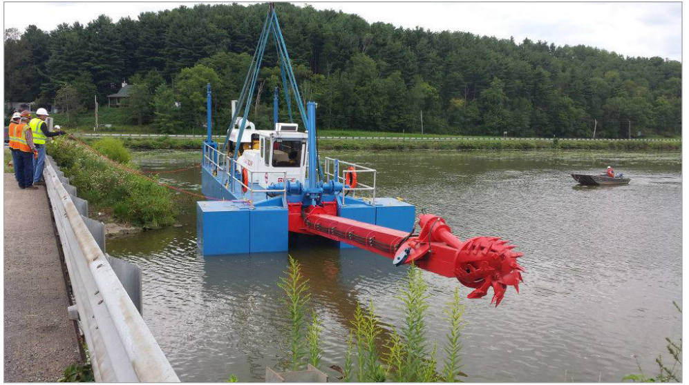
The red cutter head from “The Cadiz” is submerged and will remove 1 to 4 feet of sediment in select areas of Tappan Lake. Mechanical methods will be used to dredge during winter draw-down.

Those who travel the US 250 corridor in Harrison County along Tappan Lake may have noticed the little blue boat and other activity at the east end of the lake. The boat is known as the “Cadiz” and is the dredge barge that will remove sediment from Tappan Lake. Beneath the barge lies a large capacity cutter head and pump system that works like a giant shop-vac to collect and pump the silt and sediment to the upland settling ponds and drying basins. Temporary piping under US 250 takes the sediment from Tappan Lake to property owned by MWCD at the northeast corner of Addy Road and US 250.