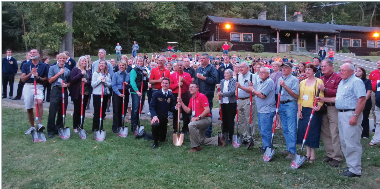
Pictured in the groundbreaking are contributors and supporters of FFA Camp Muskingum including representatives from MWCD.

Congratulations to the Future Farmers of America (FFA) Camp Muskingum on the shores of Leesville Lake in celebrating the ground breaking of their new 7,500 sq ft multi-purpose facility, The Discovery Center. The facility has an occupancy of 350 for banquet, educational and recreational presentations which will be used by FFA chapters as well as business groups and other non-profits. This is the only FFA camp in the state of Ohio and serves thousands of children across the state. MWCD provided sanitary sewer upgrades that serve the camp as an effort to keep lake waters clean.